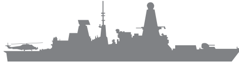
For navy ships